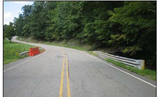
Roadway View: Looking Northbound along CR-617