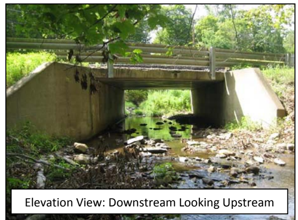
Elevation View: Downstream Looking Upstream